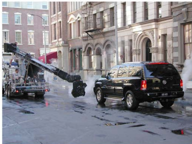
Users of the 10-minute interactive program navigate the vehicle through a city landscape.

News / Events / Commentary / Q&As / Etc.