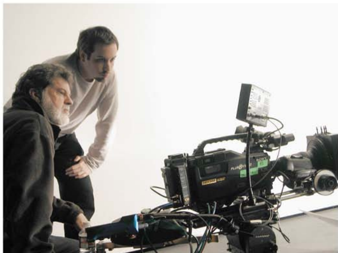
Dean Cundy, cinematographer (left), and Kief Davidson, director, shooting the Escalade for the DVD-ROM.